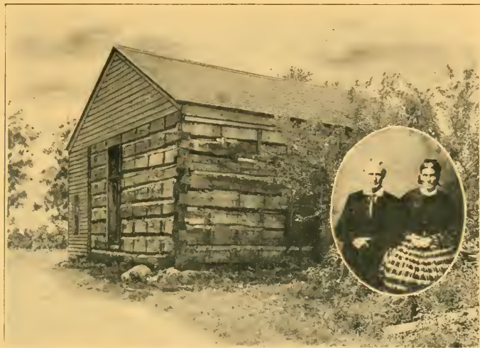
THE HOME OF A FIRST SETTLER